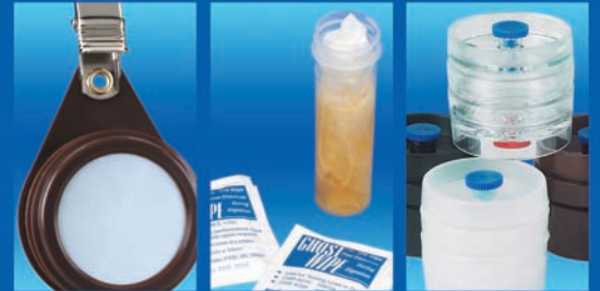
Passive Badges Wipes Cassette Filters