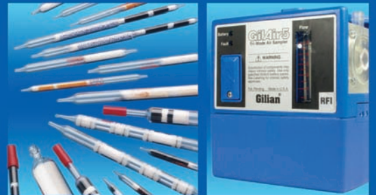
Sorbent Tubes Sampling Pumps